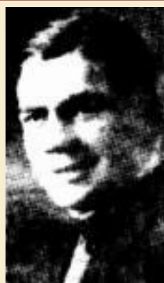
Courier Mail (Brisbane) 12 Mar. 1948, 3