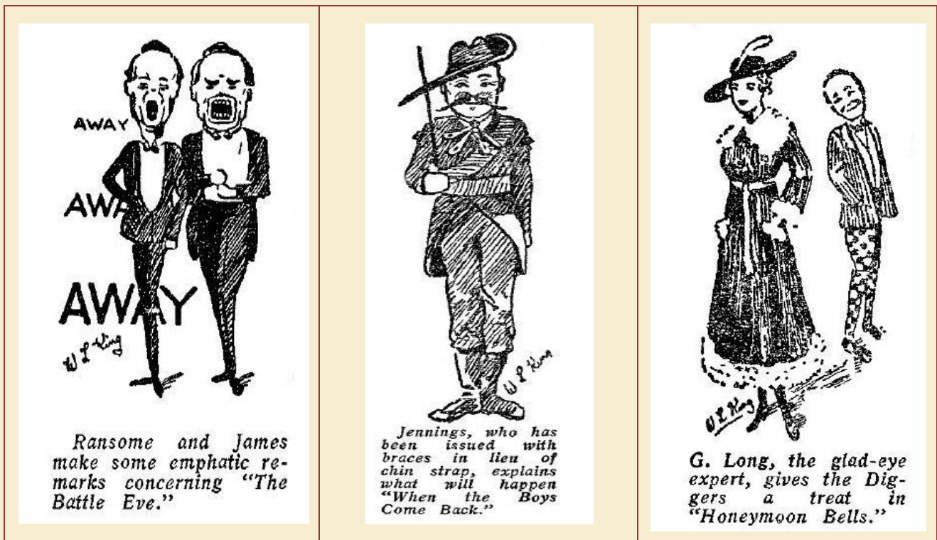
Aussie 7 (Sept. 1918), 20.