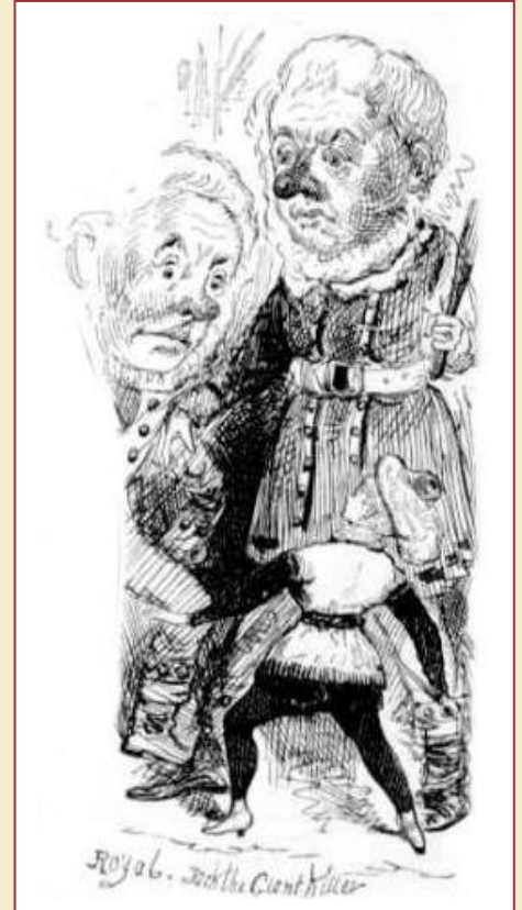
Australasian Sketcher with Pen and Pencil 18 Jan. (1879), 168.