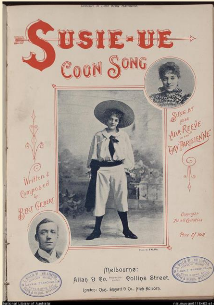
National Library of Australia