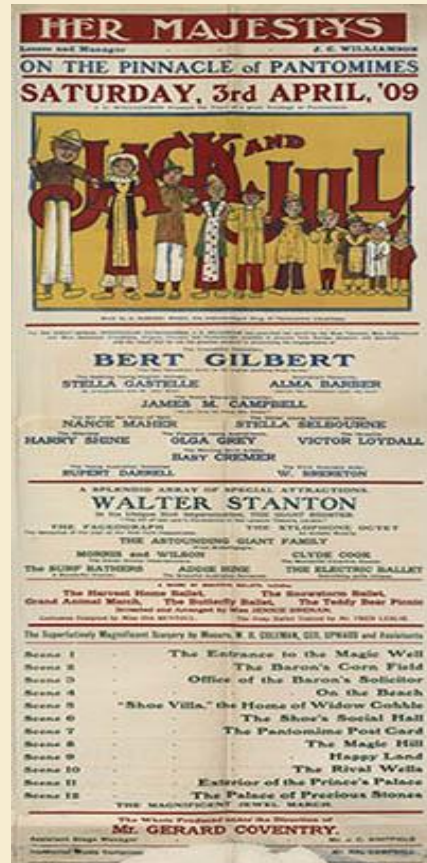
Humpty Dumpty (1908) and Jack and Jill (1909) posters