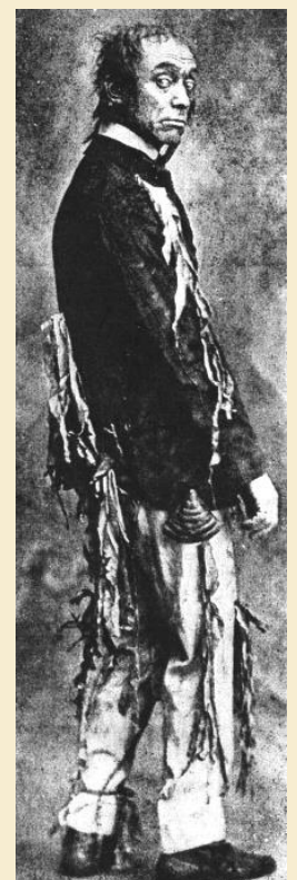
As King Sollum in Humpty Dumpty (1907) Source: Viola Tait (2002), 153.