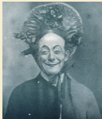
Left: As Baron Bounder ( Babes in the Woods , 1897)