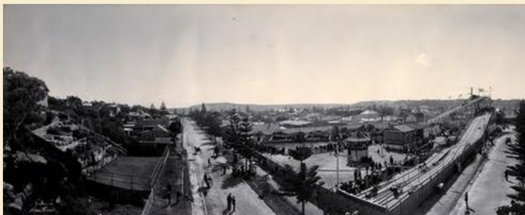
The Manly Chute (ca. 1903-1907)