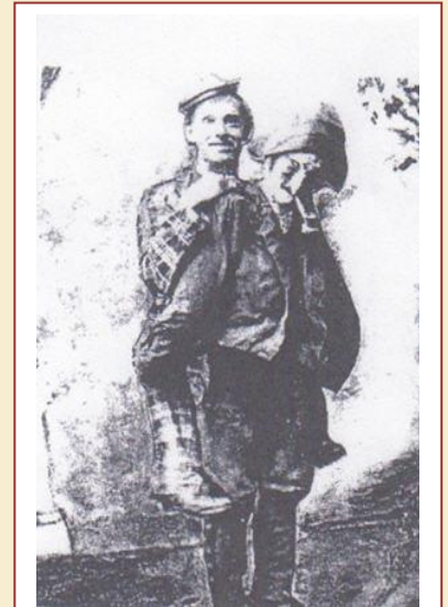
"On the Back of My Daddy O"