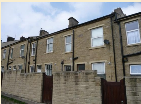
Parkinson Home: 10 Park Road Bradford. The people in household in 1861 (above).